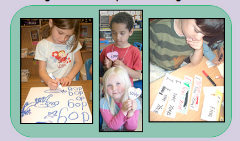
If handwriting motions are not efficient it interferes with the whole writing process.